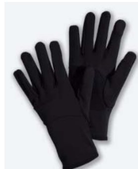
Cold Weather Layers